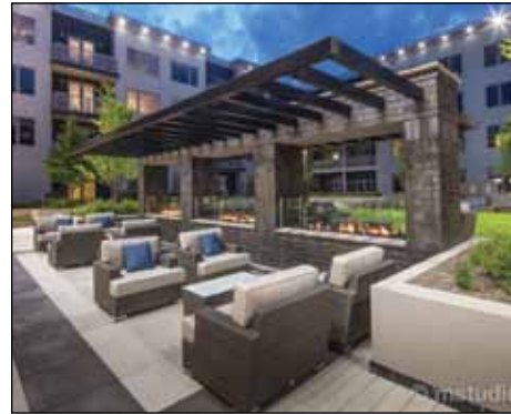
The Ave PS&S - Florham Park, NJ

LANDSCAPE ARCHITECTURAL SITE DESIGN CATEGORY: