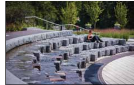
The Grove at Connell Center Melillo + Bauer - Berkeley Heights, NJ