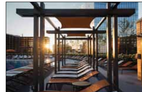
The Modern Melillo + Bauer - Fort Lee, NJ

LANDSCAPE ARCHITECTURAL RESIDENTIAL DESIGN CATEGORY: