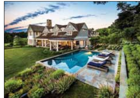
Navesink River Road Residence Alan Tufts/Siciliano Landscape Company

LANDSCAPE ARCHITECTURAL RESIDENTIAL DESIGN CATEGORY: