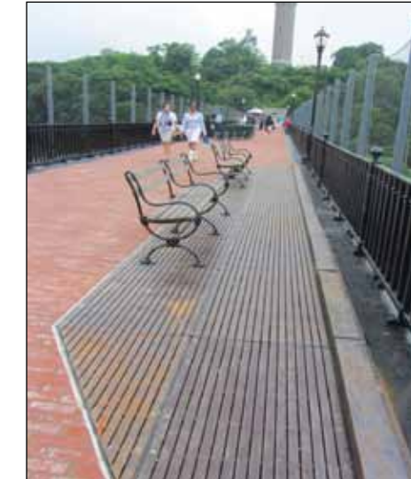
Rehabilitation of the High Bridge over the Harlem River MKW - New York, NY

HISTORIC PRESERVATION/ RESTORATION CATEGORY: