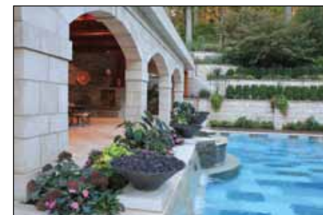
Montclair Manor Landscape Techniques, Inc. - Montclair, NJ

LANDSCAPE ARCHITECTURAL RESIDENTIAL DESIGN CATEGORY: