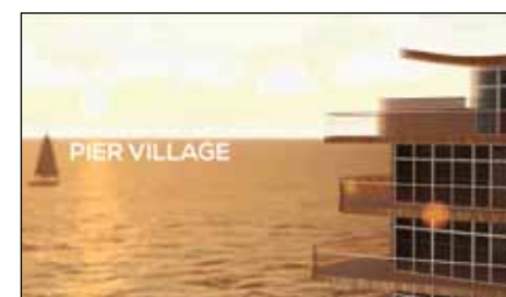
Pier Village Phase 3 Melillo + Bauer - Long Branch, NJ