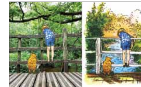
Finding Wonder Outside and Between the Pages Esther Lim - New Brunswick, NJ