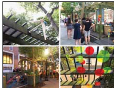
Princeton Energy Parklet Nelson Weiss, Inc. - Princeton, NJ