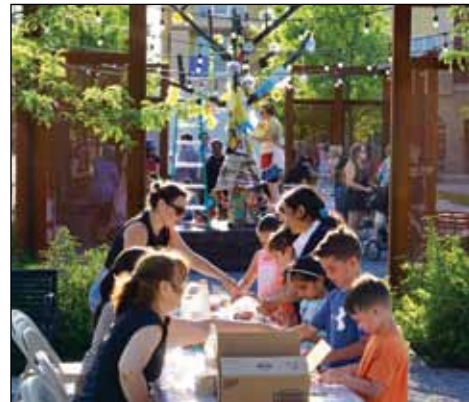
Glassboro Town Square Clarke Caton Hintz - Glassboro, NJ

LANDSCAPE ARCHITECTURAL SITE DESIGN CATEGORY: