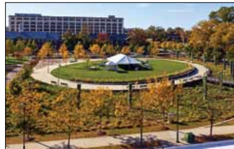
League Island Park Sikora Wells Appel - Philadelphia, PA