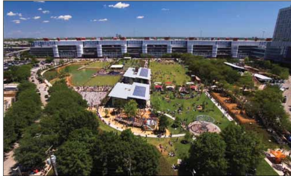
Long-term Strategic Operations and Management Plan for Discovery Green ETM Associates - Houston, TX

LANDSCAPE PLANNING AND ANALYSIS CATEGORY: