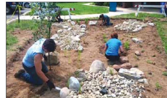
ENVIRONMENTAL ENHANCEMENT READING RAIN GARDENS: A COMMUNITY ENVIRONMENTAL INITIATIVE FOR WOODBRIDGE LIBRARIES WOODBRIDGE, NJ Rutgers Cooperative Extension Water Resources Program