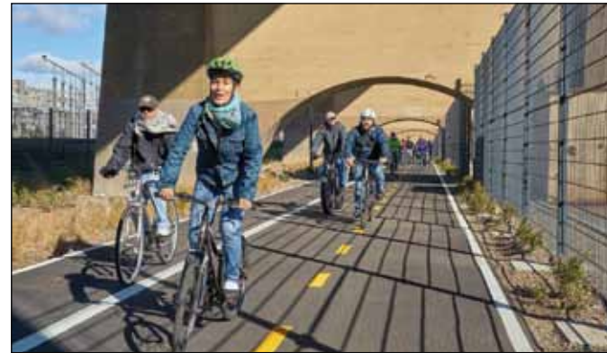
LANDSCAPE ARCHITECTURAL DESIGN: SITE DESIGN RANDALL'S ISLAND CONNECTOR BRONX, NY Mathews Nielson Landscape Architects, PC