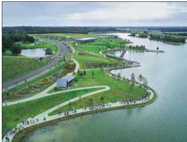
LANDSCAPE PLANNING & ANALYSIS SHELBY FARMS PARK: HEART OF THE PARK MEMPHIS, TN ETM Associates, LLC