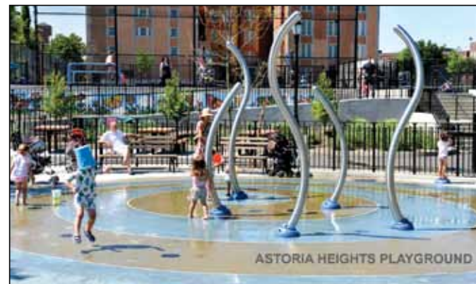
LANDSCAPE ARCHITECTURAL DESIGN: SITE DESIGN ASTORIA HEIGHTS PLAYGROUND QUEENS, NY NYC Parks