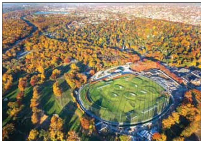
LANDSCAPE ARCHITECTURAL DESIGN: SITE DESIGN CROTON RESERVOIR WATER FILTRATION PLANT BRONX, NY Ken Smith Workshop