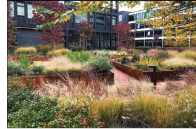
LANDSCAPE ARCHITECTURAL DESIGN: SITE DESIGN HARRISON URBY HARRISON, NJ Melillo + Bauer Associates, Inc.