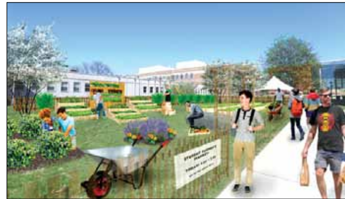
STUDENT: UNBUILT PROJECT THE GARDEN WALK NEW BRUNSWICK, NJ Rutgers University