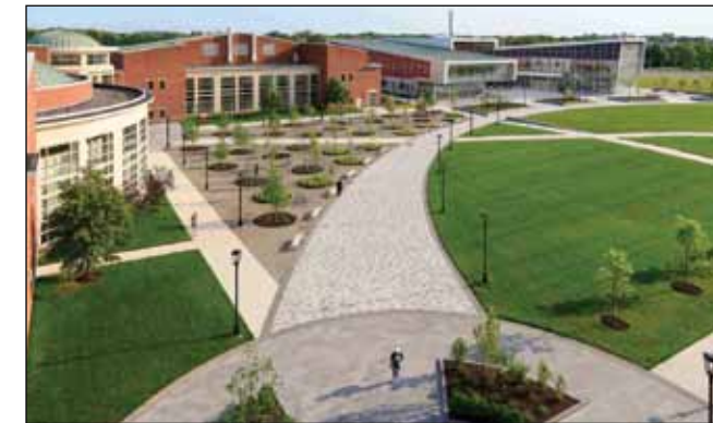
LANDSCAPE ARCHITECTURAL DESIGN: SITE DESIGN ROWAN COLLEGE AT BURLINGTON COUNTY QUAD TRANSFORMATION MOUNT LAUREL, NJ Sikora Wells Appel