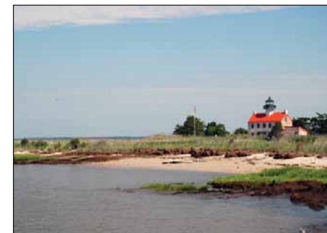
LANDSCAPE PLANNING & ANALYSIS BAYSHORE HERITAGE BYWAY CORRIDOR MANAGEMENT PLAN SALEM TO CAPE MAY, NJ Lardner/Klein Landscape Architects, PC