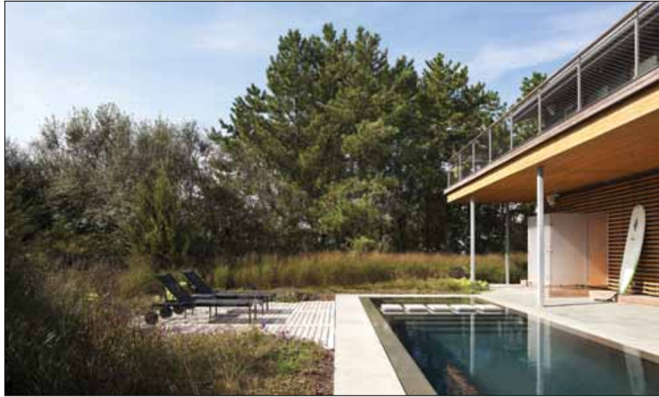
LANDSCAPE ARCHITECTURAL DESIGN: RESIDENTIAL/GARDEN DESIGN AVALON RESIDENCE AVALON, NJ ThinkGreen, LLC Landscape Architecture, Ecological Design & Construction